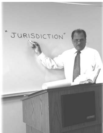
All faculty teaching in the NCC Paralegal Program are experienced attorneys.

* Paralegals may not provide legal services directly to the public except as permitted by law.